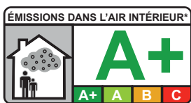
Indoor air emissions